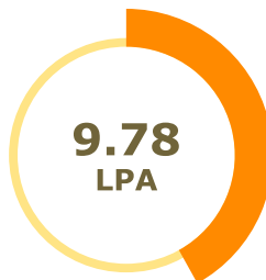
M.Sc 41.94% Placed