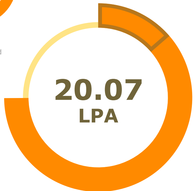
Total 74.90% Placed