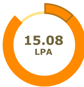
M.Des 87.50% Placed