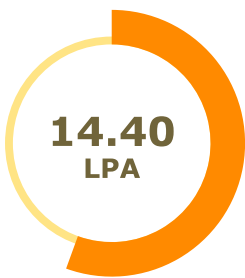
B.Des 55.56% Placed