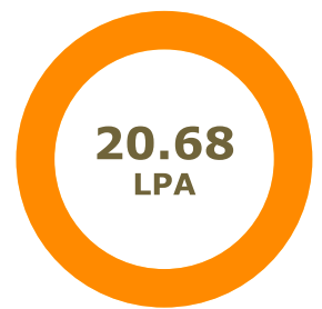
Ph.D 100% Placed