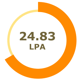
M.Tech-DD 66.67% Placed