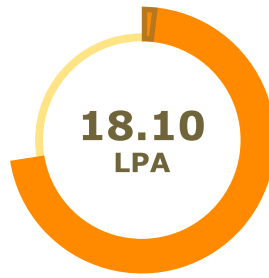
M.Tech 72.52% Placed