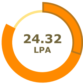
B.Tech 82.62% Placed