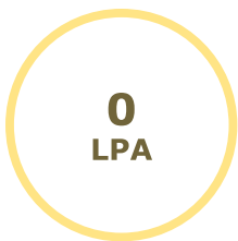
MA-LA 0% Placed